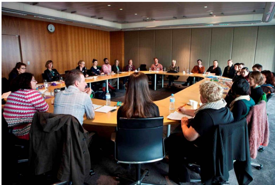
Photo: Researchers' masterclass